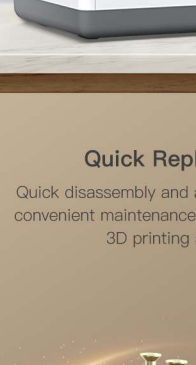
Sermoon V1 (Standard Version)